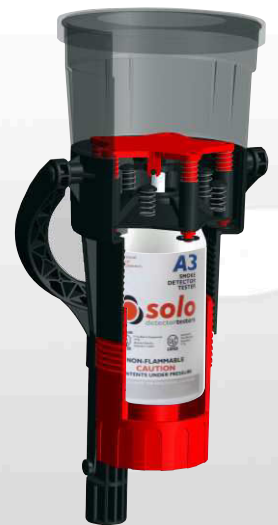
Solo 330 for use with Solo A3 & C3 Aerosols

Solo 332 is available for larger diameter detectors.