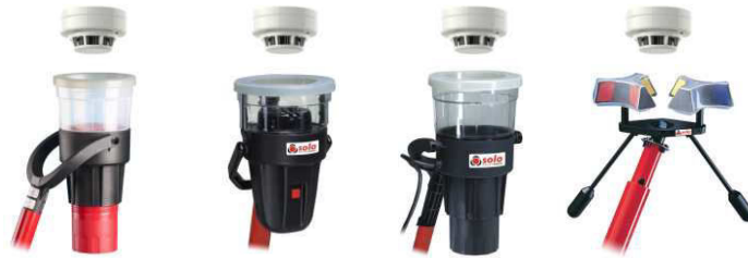
Solo 330 Aerosol Dispenser