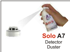
Solo A7 Detector Duster