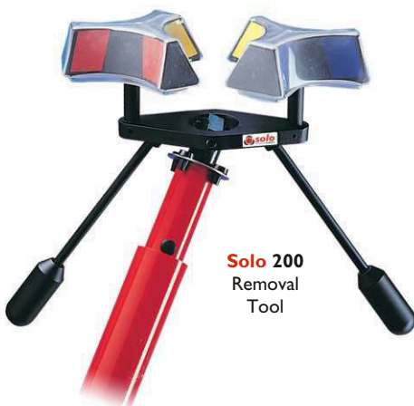
Solo 200 Removal Tool