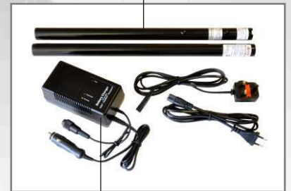
Solo 725 Fast Charger