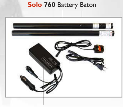
Solo 726 Fast Charger