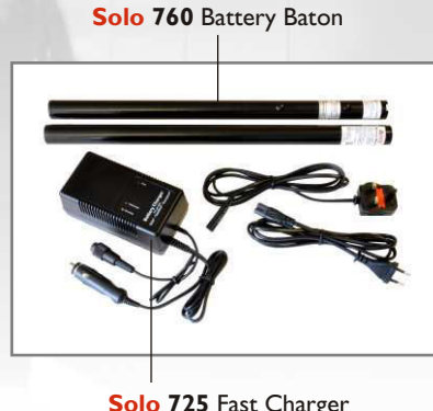
Solo 725 Fast Charger