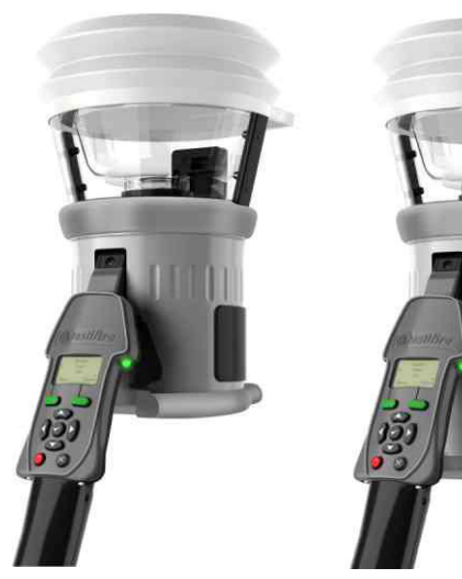
Testifire 1000 Smoke & Heat Testing